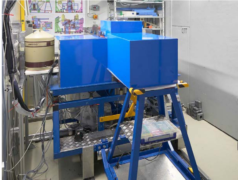
Figure 1: Instrument PGAA from the direction of the beam stop. On the left-hand side the Dewar of the detector can be seen. (Copyright by W. Schürmann, TUM).