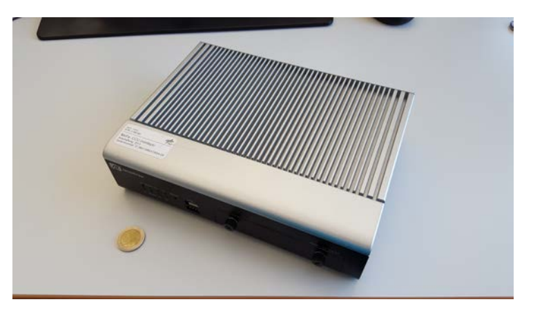
Figure 1: V2X communication unit.