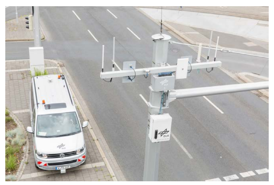
Figure 4: Reference Vehicle T5.

public roads. As a moving lab in AIM it is also be used for project specific application in the field of V2X.