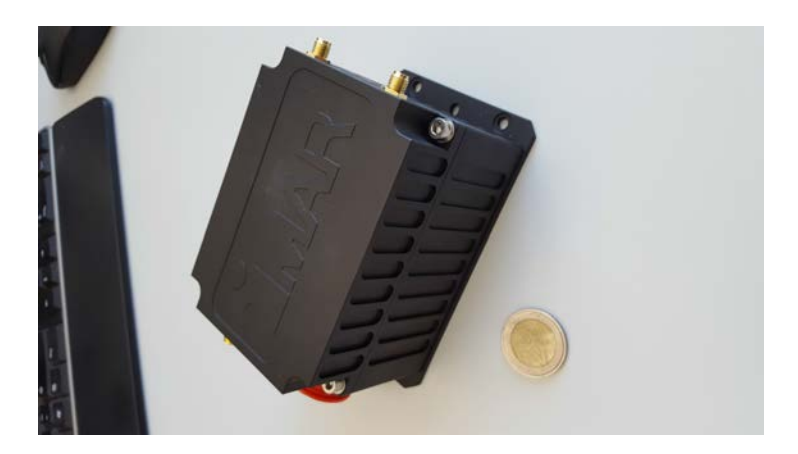
Figure 2: Navigation platform.