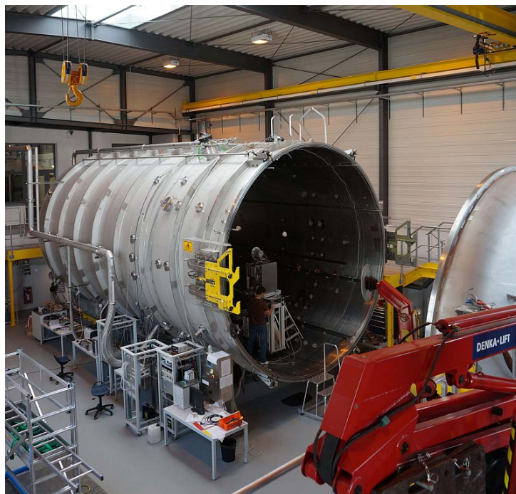
Figure 1: View into the open vacuum chamber of the STG-ET facility.

Since the end of 2011 DLR operates a space propulsion test facility specifically designed for EP, the High Vacuum Plume Test Facility Göttingen – Electric Thrusters (STG-ET). Several special features tailored to electric propulsion testing have been implemented. This includes a large vacuum chamber mounted on a low vibration foundation, a low sputtering plasma beam dump target, a performant pumping system, and comprehensive plasma diagnostics. With respect to thruster testing, the design focus was on accurate thrust measurement, plume diagnostics, and on the possibility of performing investigations of plume interaction with spacecraft components like e.g. solar arrays.