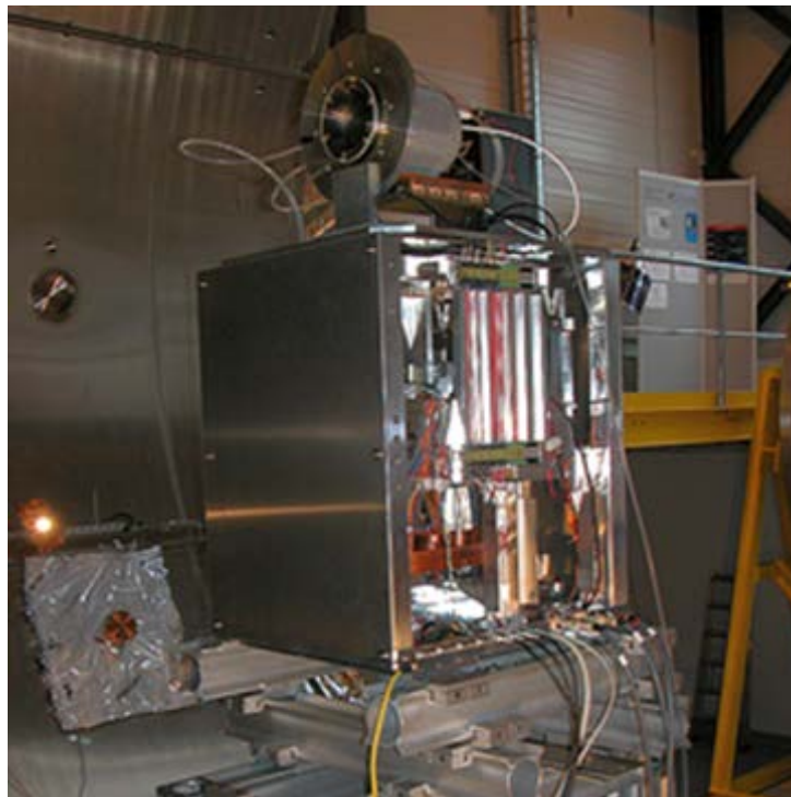
Figure 3: Thrust balance with open lid on one side. A gridded ion thruster is mounted on the balance.

Calibration is crucial and the DLR thrust balance has two independent methods for performing this task. One method uses an electromagnetic voice coil calibration, the other is a direct weight gravimetric calibration. The voice coil method uses an electrically calibrated coil to apply a known force to the balance platform. The gravimetric method is based on accurately measured masses for a direct calibration. The balance includes a device that has small weights which can be lifted from a holder. Their weight force is applied to the thruster platform by a thin wire guided over a pulley. While the voice coil method is faster, shows smaller variances and allows a larger number of measurement points compared to the weight calibrator, systematic errors may occur. The gravimetric method permits to trace the calibration back to an absolute standard.