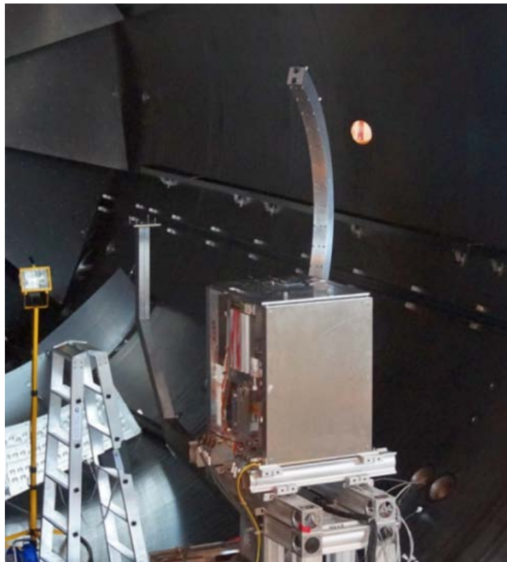
Figure 4: Beam diagnostics systems. On the left the single plane arm, and in the middle of the photo, the multi-sensor arm can be seen.

Besides measurement of thrust monitoring of the ion beam distribution is an important assignment in EP thruster qualification. The STG-ET mainly uses three systems for ion current measurement in the EP plume. Closest to the thruster exit at a distance of 0.7m a two-dimensional rotational scanner with 15 Faraday cups is located. At 1.5m a single plane rotational scanner is able to host different instruments. A retarding potential analyzer (RPA), a Faraday cup or Langmuir probes can be mounted and can sweep part of a circle down into the backflow. The third system is a flat field scanner with two Faraday cups able to scan an area of 3m in horizontal and 1m in vertical direction. Figure 4 shows the two rotational diagnostics arms, i.e. the single plane arm and the multi-sensor arm located behind the thrust balance. The maximum scanning speed is 2deg/s for the single plane arm, and up to 10deg/s for the multi-sensor arm.