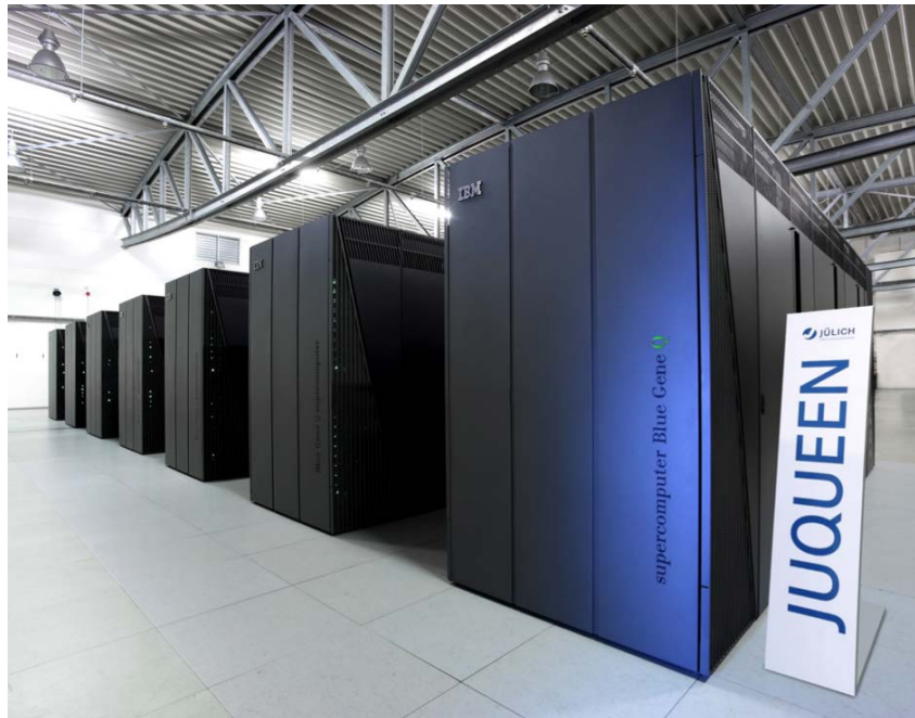
Figure 1: JUQUEEN at the Jülich Supercomputing Center.

Scientist of RWTH Aachen University, Forschungszentrum Jülich or German Research School for Simulation Sciences (GRS) are also qualified for applications for computing time within the Jülich-Aachen Research Alliance (2015) (JARA-HPC).