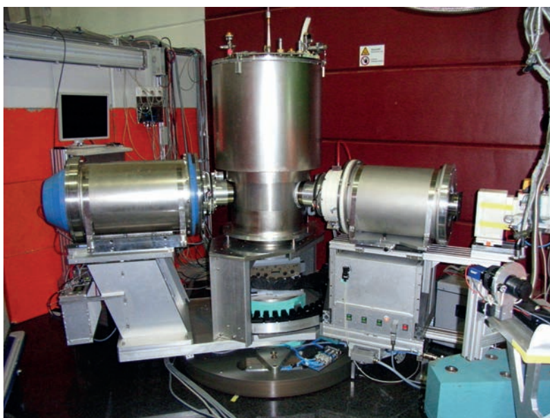
Figure 1: Instrument POLI with SNP setup.

general nuclear and magnetic scattering processes. Generally, this leads to the direction's determination of the magnetic interaction vector of magnetic structures. For those structures coinciding nuclear and magnetic reflections in reciprocal space, SNP leads to the amplitude's determination of the magnetic interaction vectors, and hence to the magnetisation distribution. SNP could also be employed to study the magnetic domain distribution.