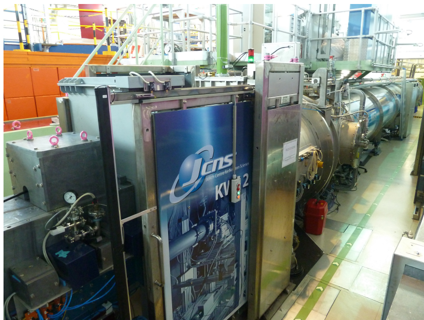
Figure 1: Instrument KWS-2.