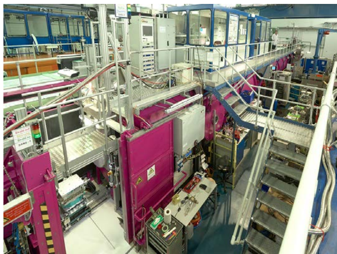
Figure 1: Instrument SANS-1 (Copyright by W. Schürmann, TUM).

tubes to provide 8 mm x 8 mm spatial resolution. A second high resolution (3 mm) detector, installed downstream of the primary detector is foreseen for 2016.