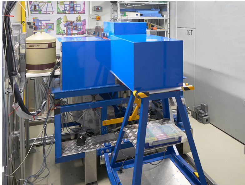
Figure 1: Instrument PGAA from the direction of the beam stop. On the left-hand side the Dewar of the detector can be seen.