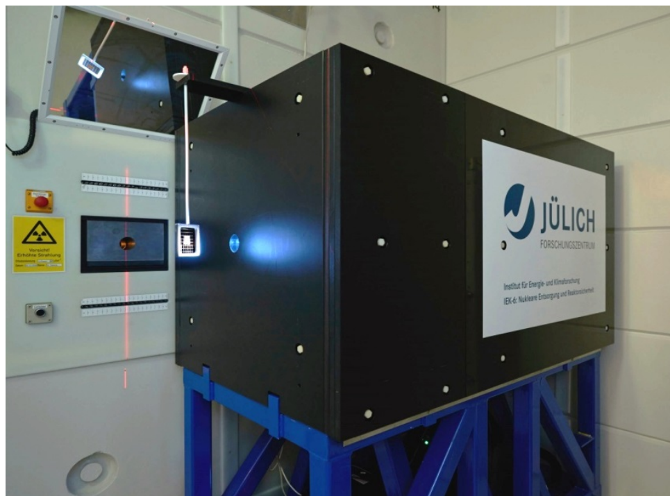
Figure 1: FaNGaS set-up with neutron collimator, gamma counting and sample positioning system in the MEDAPP bunker (picture: TU München, W. Schürmann. Also submitted to Journal of Radioanalytical and Nuclear Chemistry article ,Prompt and delayed inelastic scattering reactions from fission neutron irradiation - first results of FaNGaS'(JRNC-D-15-01030)).

2.1 keV resolution at 1332 keV) connected to a digital spectrometer (DSPEC 50). Shielding against scattered neutrons and gamma radiation is achieved by 30 cm of PE, 1 cm of B 4 C and 15 cm of ordinary lead bricks. The sample position during irradiation is 67 cm away from the detector surface. A second measurement position is located 17.2 cm from the detector surface allowing measurement of decay activity from (n,γ), (n,p), (n,2n), or (n,α) reactions from samples after irradiation (see FIG 1).