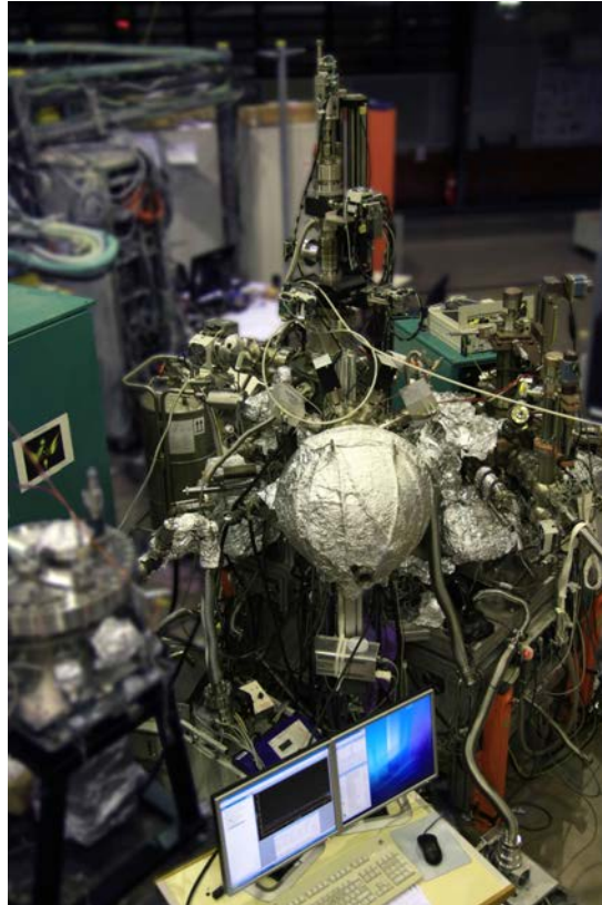
Figure 1: View of the PHOENEXS station.

Currently, the lowest sample temperature on the manipulator is 200 K. Upgrade of the cryostat is planned for 2016, which will improve sample cooling performance.